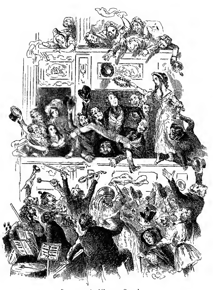
Lorrequer's début at Strasburg.